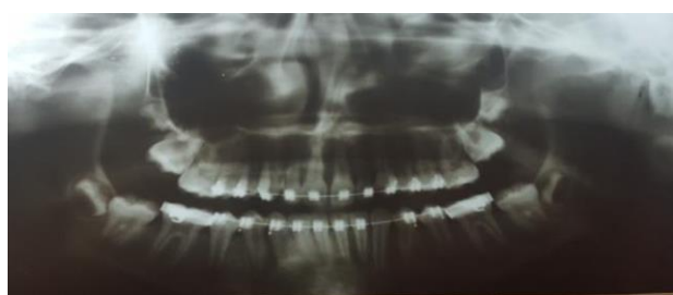
Fig 4. Final panoramic radiograph.

duration of usage of these retainers decreased for the next six months. All the data indicated successful treatment (Fig. 4). the retention period, no root resorption or central incisor rotation or intrusion was found.