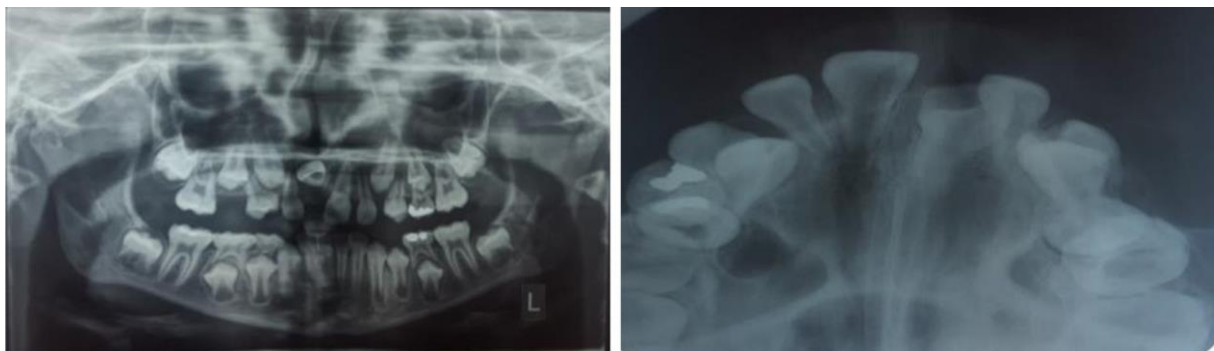
Fig 2. Pretreatment panoramic and occlusal radiographs.

midline was found to shift to the right and the adjacent teeth had drifted into the impacted central incisor space. The patient had maxillary constriction. Overjet was 2 mm and overbite was 4 mm. The lower teeth had moderate crowding.