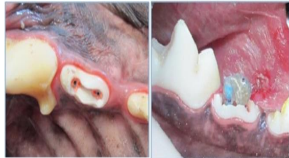
Figure 1- (A) Root canal therapy of the fourth premolar, including a conductive sleeve in both mesial and distal roots containing extending wires from miniature electric device. (B) Experimental device embedded in place.

direct electric stimulator (watch battery 1.55V) and resistance in an acrylic cap including two conductive stainless steel wires extending toward the apex in a rigid conductive sleeve. The remaining spaces in canals were filled by means of flowable gutta-percha (Meta Biomed Co., Cheongju, Korea) and AH-26 sealer (Dentsply, DeTrey, Konstanz, Germany) (Figure 1).