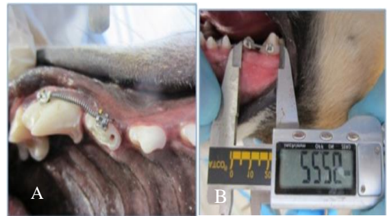
Figure 2- (A) Orthodontic brackets and active NiTi coil springs on 0.018 segmental stainless steel were used for generating reciprocal force on the fourth premolar and the first molar. (B) Measuring the tooth movement distance using sliding Boley gauge caliper intra-orally.

The specimens were sectioned mesiodistally parallel to the long axis of the roots (4 \mu m thickness) with a microtome, and stained with hematoxylin and eosin. Qualitative histomorphometric assessments of the coded specimens were made by the same examiner twice with a light microscope and digital photographs were obtained and recorded. The experimental process was well tolerated in all samples. The animals were kept under soft diet and none of them lost weight significantly. In all samples, the experimental devices remained in place and intact.