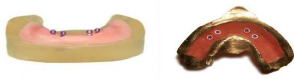
Fig 3. BL design in cast and impersion.