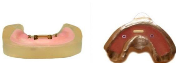
Fig 4. BB design in cast and impersion.