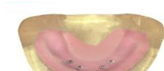
Fig 5. BR design in cast and impersion.

Dolder bar was extended posteriorly and parallel to the ridge. An 8 mm ITI gold clip was placed on BD bar. A 6 mm ITI gold clip was placed on each posterior bar (Table 1). Three relevant ITI titanium matrices were located on the clips and engaged. The titanium matrices were positioned parallel to each other and vertically positioned to the test cast using the same dental surveyor. The overdenture was fixed to the test cast and the acrylic part of the overdenture was fabricated as explained previously (Fig. 5).