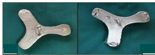
Fig 6. The load cell transmitted the force from the machine to the overdenture.

The crosshead speed was adjusted at 51 mm/minute, which would approximate the rate of denture movement during mastication. 42 The machine applied and measured tensile dislodging forces in three directions of vertical, oblique, and anterior-posterior. The peak load was measured and was