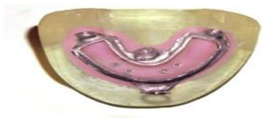
Fig 2. Metal framework.