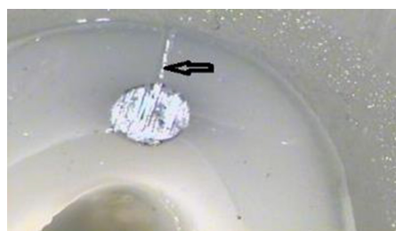
Fig 2. Horizontal view; the arrow shows the lateral crack perpendicular to the pin (x25).