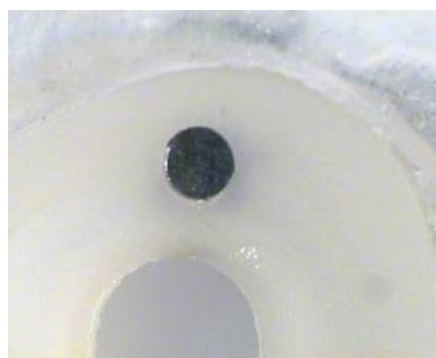
Fig 3. Horizontal view; no crazing is observed in tooth (x25).