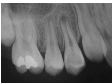
Figure 2- Initial radiograph of the tooth