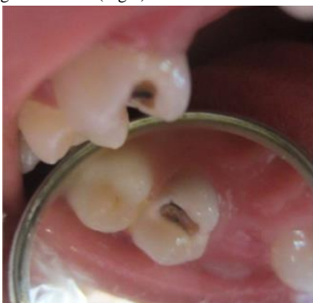
Figure 1- Clinical view of the tooth

examination showed periapical radiolucency and PDL widening of tooth #5 (Fig 2).