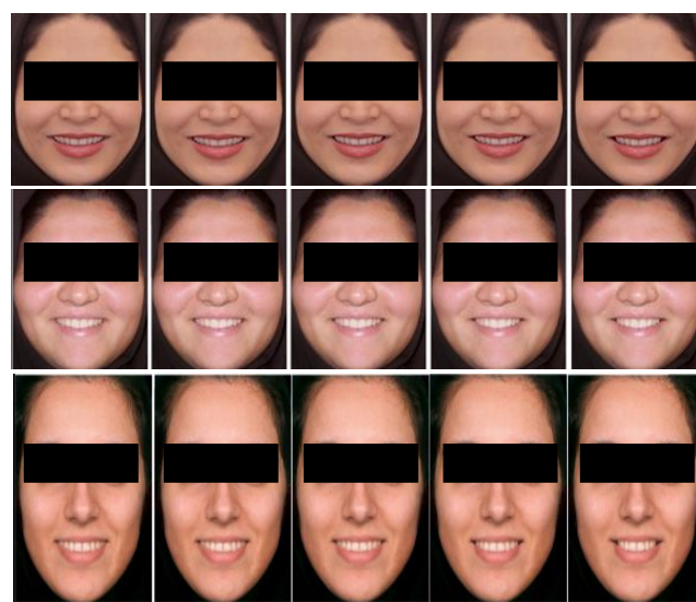
Figure 2- Sample questionnaire

At the bottom of each photo a scaled line 0-100 (VAS line) was prepared, with the explanation that zero represents the least attractive and the number 100 represents the most attractive. Also, at the top of each page, a question was placed, determining the amount of attractiveness of each photo on the specified range under it. Participants specified their opinions separately on the VAS line for each 15 photos (Fig. 2). In the end, the age and sex of each participant in this study as well as experience of experts were recorded.