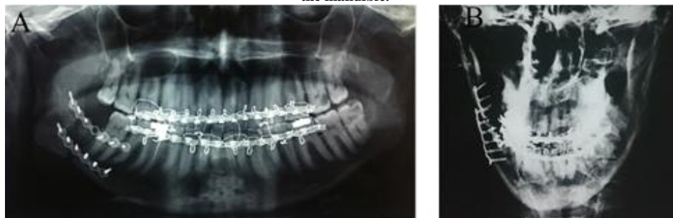
Figure 3- Radiographic images of the patient's mandible after open reduction and internal fixation. A- Panoramic view. B- Poster anterior (PA) view of the mandible

The patient underwent fixation surgical procedure and the broken pieces were fixed with two mini-plates, the superior one in monocortical manner to prevent the teeth roots damage and the inferior one was applied bicortically 11 (Figure 3). The patient was discharged from the hospital two days after surgery. Elastic guides were used at both sides to limit jaw movements during the six-week follow up period. After six weeks, the patient had normal occlusion and could open her mouth by 45 mm. The arch bar was then removed since the patient gained full recovery.