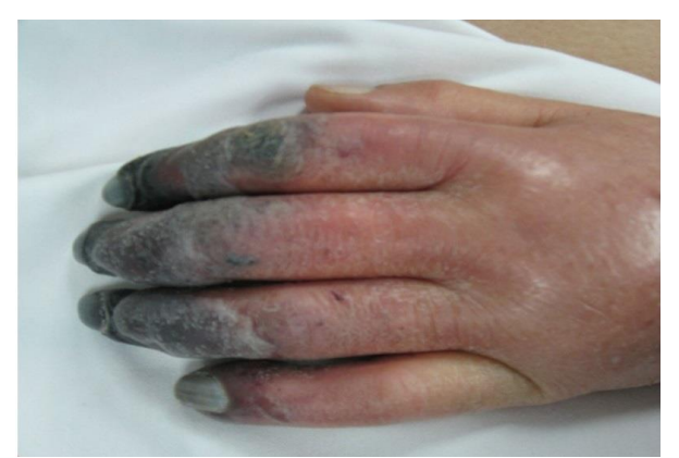
Fig. 3. Cyanosis in fingers in four extremities developed to complete gangrene.

nasal passage, nasal cavity and nasopharynx (Figure 3) the left nasal passage was chosen for nasal The left nasal cavity was intubation. first anesthetized: but there was difficulty for administration of lidocaine spray since the patient was under treatment with a maintenance dose of anticoagulant. A combination of lidocaine plus phenylephrine on cotton swab was administered in the anterior nares area, the anterior ethmoidal nerves; and sphenopalatine ganglion. A number 7 cuffed tracheal tube was passed through the nasal cavity to the trachea over the fiberoptic bronchoscope; its passage was preceded by direct visualization and approval of the vocal cords and then, the trachea; due to patient dyspnea, bronchoscopy was done in sitting position (Figure 4). The vocal cords had changed from their normal status to severely enlarged and edematous