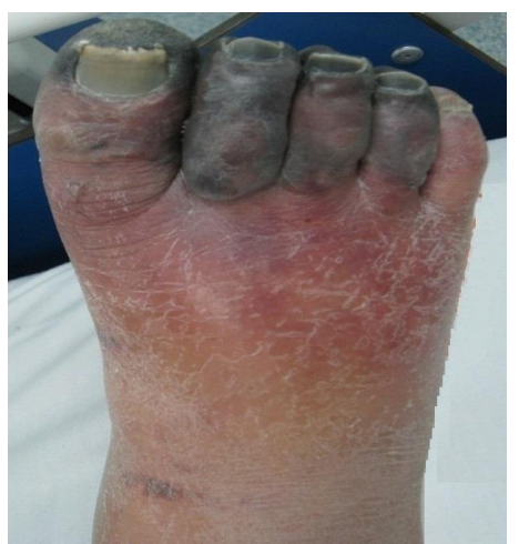
Fig. 2. Right lower extremity cyanosis was noted which spread to four extremities 24 hours after first cyanotic changes.