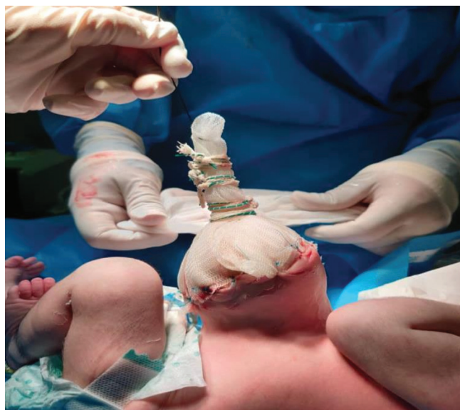
Figure 2: Day 3 gradual reduction of viscera