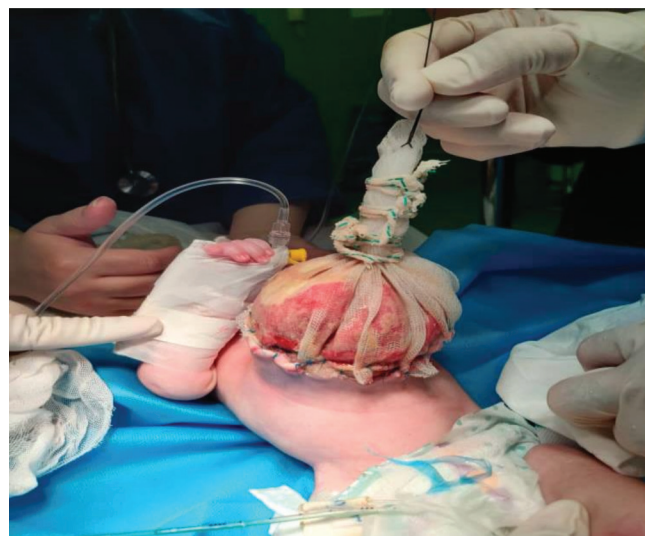
Figure 1: Day 1 Dual mesh sutured to skin

sac and a silo is created and the edges of the mesh are sutured to the skin around the omphalocele. This method reduces the chance of infection and diffuse peritonitis, as well as the possibility of damage to the viscera and bleeding during removal of the sac and the duration of the operation.