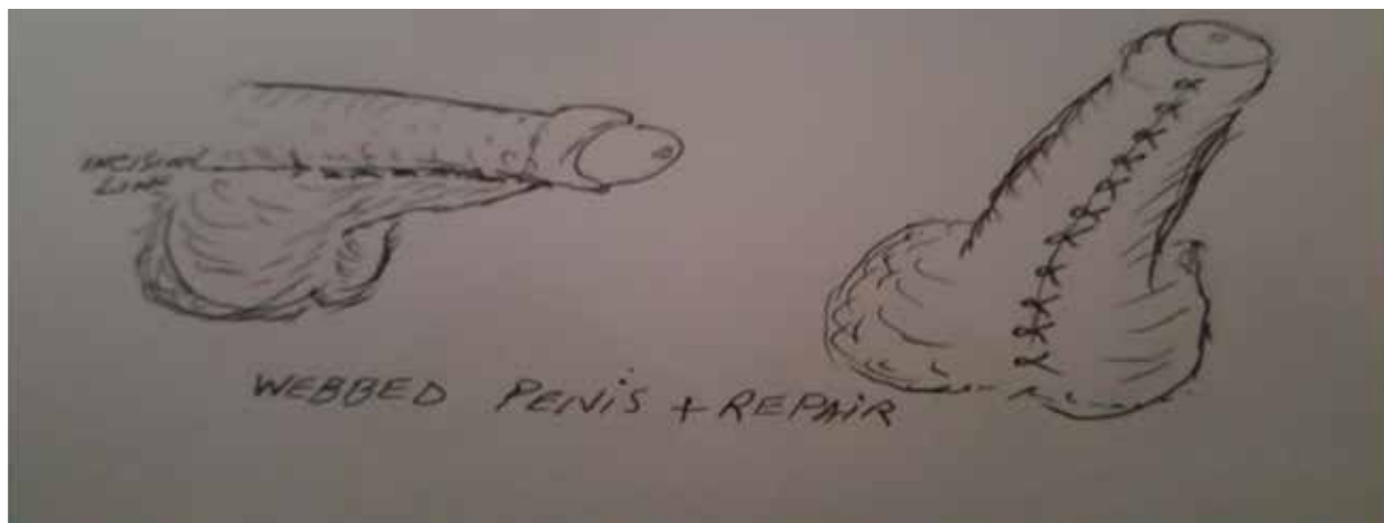
Figure 5: A webbed penis and repair procedure.

A. et al 13 in 2005 reported their 5 years experiences with 80 patients of concealed penis, with cosmetic improvement, in which only one complication occurred which needed reoperation.