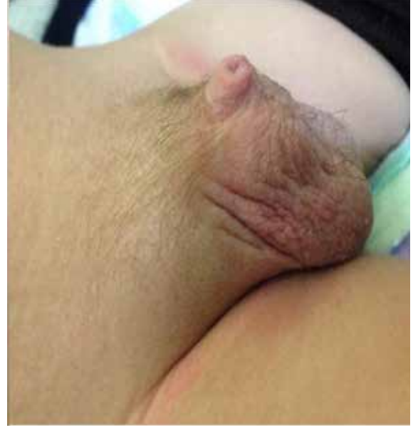
Figure 1: A case of concealed penis that was referred after hormone therapy.