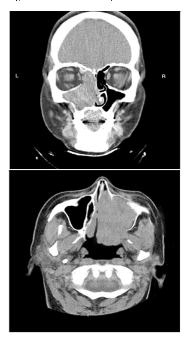
Figure 1. Initial CT scan of the patient.

A grossly complete removal of the tumor was performed using midface degloving approach. A complete sphenoethomidectomy along with maxillectomy and resection of orbital floor was done. In histopathology report, surgical margins were free of tumor. Seven weeks after surgery, the patient developed nasal obstruction again. The imaging study showed a huge recurrence in which the tumor had extended from palate up to cribriform plate with involvement of the hard plate. The intracranial structures seemed to be spared. Reoperation performed with the same approach. The second and third molar teeth and