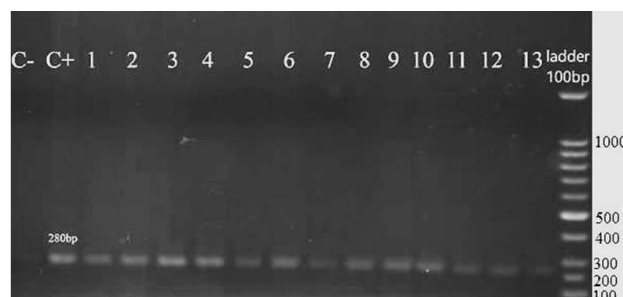
Figure 2. Results of PCR amplification of MexB gene (280 bp) of Pseudomonas aeruginosa , c-: negative control, c+: positive control, Ladder 100bp.