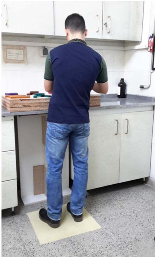
Figure 1. Prolonged standing protocol

chronic LBP subjects from the MVC of the dorsi and plantar flexors, abductors and adductors and extensors and flexors of the hip, flexors and abductors of the core, flexors and abductors and extensors of the shoulder muscles and psychological aspects with the questionnaires of STAI, TSK and PCS.