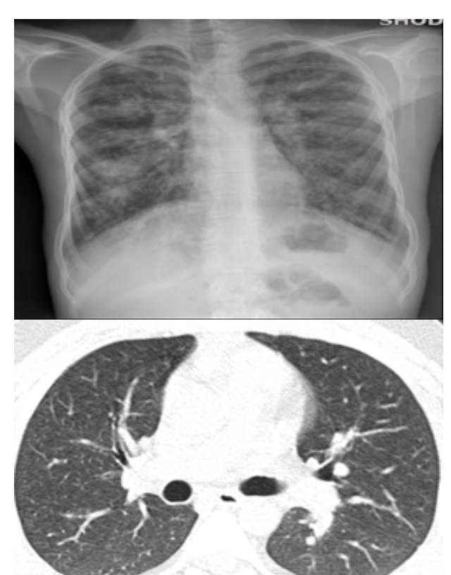
Figure 2. Chest radiography, increase in vascularity was found; (A) in the thorax CT, a presence in line with chronic atelectasis and central, peripheral bronchiectasis were detected (B).

Post-anesthetic assessment: All patients should be received 3-4 Li oxygen to breathe in the recovery room. Analgesics that do not depress the respiratory system should use in the postoperative period.6 Chest physiotherapy may also help eliminate discharges.5 specifically, in patients with hypoxemia and hypercarbia