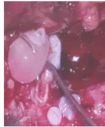
Figure 2. Surgical Excision of Spinal Cords Hydatid Cyst.

The anaphylactic reaction is a systemic event that affects various organs and could be life-threatening. 8 Anaphylaxis during anesthesia and the per-operative period is rare. Anaphylaxis can induce nausea, vomiting, urticaria, angioedema, bronchospasm, upper airway obstruction, cardiovascular collapse. The mortality rate due to anaphylaxis is between 3%-6%. 9 During excisional