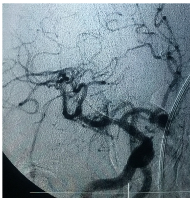
Figure 1. Digital subtraction angiography shows carotid body tumor at left carotid bifurcation and right sided anterior communicating artery aneurysm.

The carotid body is thought to originate from third branchial arch and it derives from neural crest cells, 11