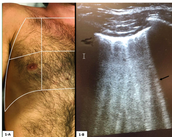
Figure 1: A: Lung zones in chest ultrasound (with permission from Credit A, Tozer J, Vitto M, Joyce M, Taylor L. Clinical ultrasound, A Pocket Manual. Springer, 2018). B: lung contusion with more than 6 B-lines (arrow).

Beside lung ultrasound was performed during the initial assessment with simultaneous resuscitation after the arrival of the patient with blunt chest trauma to the ED and then all patients were sent for CXR and CT scan immediately. We used ultrasound scanner (SonoAce X8, Samsung Medison, Seoul, Korea) equipped with a 7.5 to 10 MHz convex transducer with 5-inch wide field. Ultrasound was performed by six emergency medicine residents who were familiar with ultrasound. First, a one-hour theoretical course was held