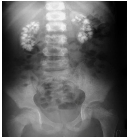
Figure 2. Patient's Abdominal X Ray ↗