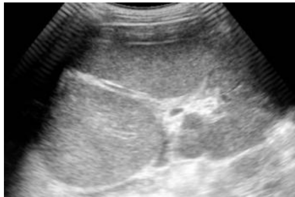
Figure 1. Renal Ultrasonography