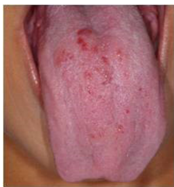
Figure 2. Clinical appearance of the lesion after 20 days of hygiene.

Two sessions with an interval of 3 months between them were necessary to treat the lesion (Figure 3). The procedures were performed under local anesthesia (lidocaine 2% and epinephrine 1:100000). In the first session, the total area of 0.75 \text{cm}^2 was treated (Figure 3a-3b). The diode laser parameters used were 2000 mW power and 1006 J total energy, and the laser was turned on for 8 minutes and 23 seconds. In the second session, the lesion covered an area of 1.2 \text{cm}^2 (Figure 3e-3f), and the laser parameters used were 2500 mW power and 540 J total energy, and the laser was turned on for 3 minutes and 36 seconds. In the second session, the irradiated area was bigger than it was in the first because of the decision to irradiate other spots that were not treated in the first session. The laser operator decided to use an additional 500 mW of power in the second session because no significant thermal harm resulting from the first session