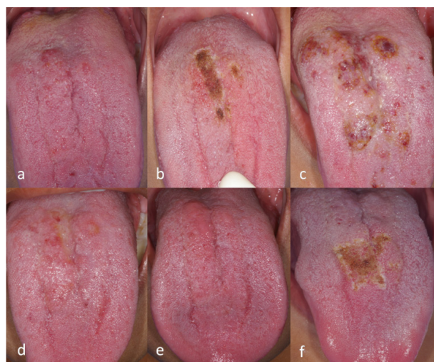
Figure 3. (a) Preoperative images of the first ablation session; (b) Dorsum of the tongue in the immediate postoperative period after the first ablation session with the diode laser; (c) Return after two days of treatment. The presence of secondary infection and edema was observed in the dorsum of the tongue; (d) After 7 days of performing oral hygiene correctly; (e) Preoperative images of the second ablation session; (f) Immediate postoperative images after the second ablation session.

Lymphangioma is usually classified according to clinical and histopathological characteristics. The diameter of the lesions allows their classification into three types: microcystic or circumscribed, macrocystic, and mixed. 2,9 Histologically, lymphangioma is differentiated into