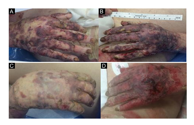
Figure 2. (A,B) Skin Graft for Bilateral Grade 3 Burn Ulcers. (C): After 10 Session of LLLT. (D) Control Side.

viability of skin graft in 100 rats. They compared different doses: 3, 6, 12 and 24 J/cm<sup>2</sup> with control group. They reported that all of these therapeutic doses increased the survival of the skin flap and higher doses had better results.<sup>25</sup>