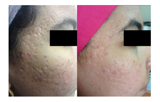
Figure 1. A 27-Year-Old Female Patient With Post-acne Scar, Before and After 3 Sessions of Fractional CO2 Laser.