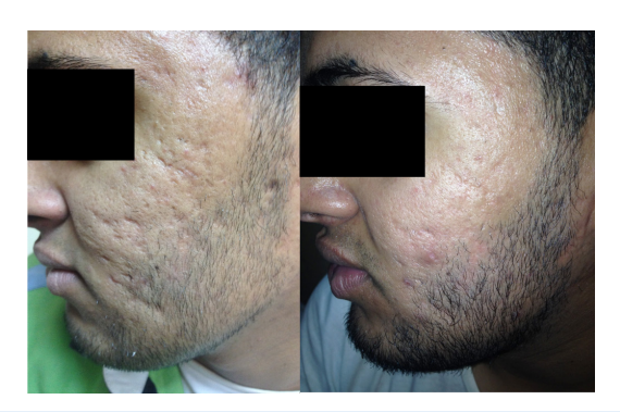
Figure 2. A 24-Year-Old Male Patient With Post-acne Scar, Before and After 3 Sessions of Fractional Erbium Glass 1540 nm Laser.