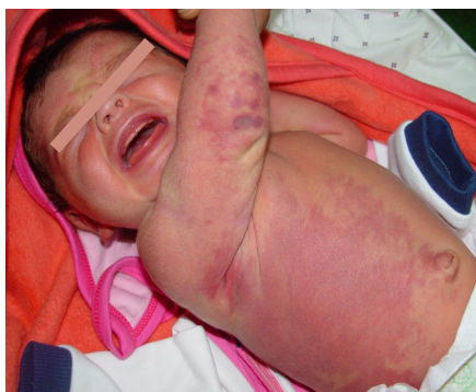
Figure 1. Large port-wine stain and Soft Tissue Hypertrophy (Compatible With Klippel–Trenaunay Syndrome ) Over the Right Hemiside of the Body of a 2-Week-Old Infant (Trunk, Lower and Upper Extremity).