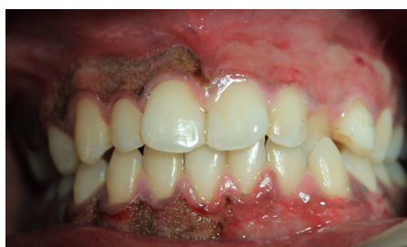
Figure 3. Depigmentation Procedure Using Diode Laser Technique on the Right Quadrant.