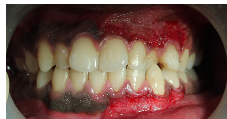
Figure 2. Depigmentation Procedure Using Scalpel Technique on the Left Quadrant.

The area was anesthetized with 2% lignocaine hydrochloride (LOX 2%, Neon laboratories Ltd, Andheri Mumbai). The depigmentation was carried out with diode laser with 980 nm wavelength (Photon Plus; Zolar Tech Technology Co Inc., Canada). The laser beam was operated with