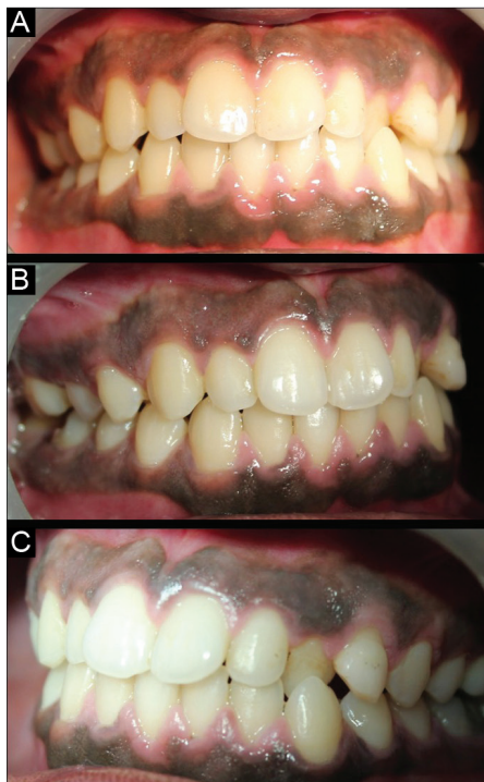
Figure 1. Preoperative Photograph: (A) Frontal, (B) Right Lateral, and (C) Left Lateral Views.

This split mouth study was carried out to achieve depigmentation in the anterior esthetic zone i.e. incisors to canine (Figure 1). The subjects were informed about the objectives of the study and an informed consent was