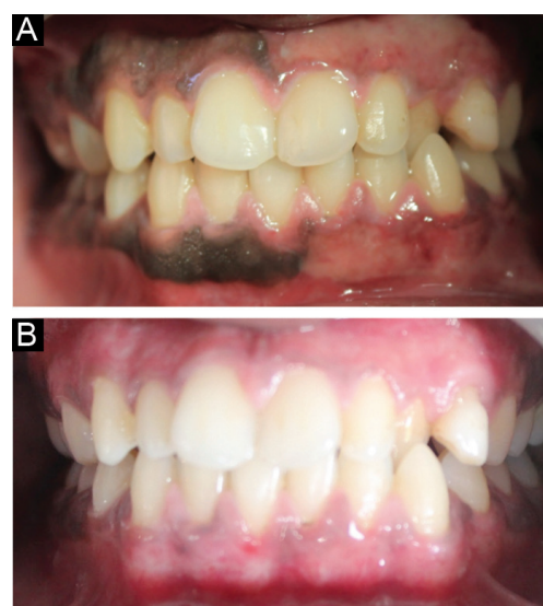
Figure 4. Assessing Wound Healing After One Week. (A) Scalpel treated area on the left quadrant (B) Laser treated area on the right quadrant.

Statistical analysis was carried out using SPSS version 17 for Windows (SPSS Inc., Chicago, USA). Non-parametric tests were used for continuous variables because the data were not distributed normally. Comparisons between the groups were performed using the Mann-Whitney U test. Results were represented as mean \pm standard deviation (SD) and P value < 0.05 was considered significant.