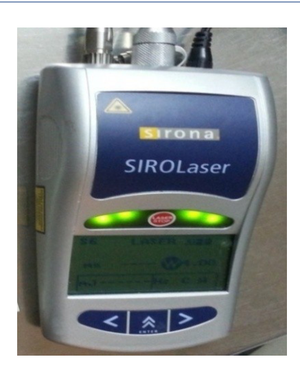
Figure 1. Equipment of Sirona Diode Laser.