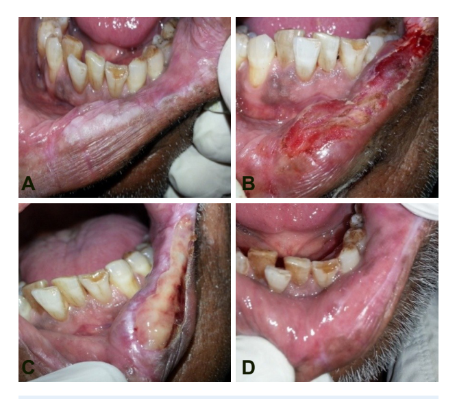
Figure 5. (A) Preoperative view of homogenous leukoplakia on lower lip. (B) Immediate postoperative view of treated area. (C) View of 1-week postoperative D) View of 6-week postoperative.

of age. It most commonly affects the lips, buccal mucosa, tongue, gingiva and floor of the mouth.<sup>9</sup> It is global prevalence varies from 0.5% to 3.4% and malignant transformation ranges between 0.17% to 17.5%.<sup>10</sup>