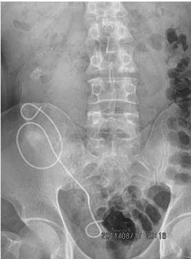
Figure 2. Plain abdominal X-ray (Kidney-Ureter-Bladder [KUB]) revealed no stone fragment and DJ in ectopic kidney.

anomalous kidneys presents a problem for urologic surgeons. Various minimally invasive management options have been previously reported, including shock wave lithotripsy (SWL), percutaneous nephrolithotomy (PNL), as well as ureteroscopy (7).