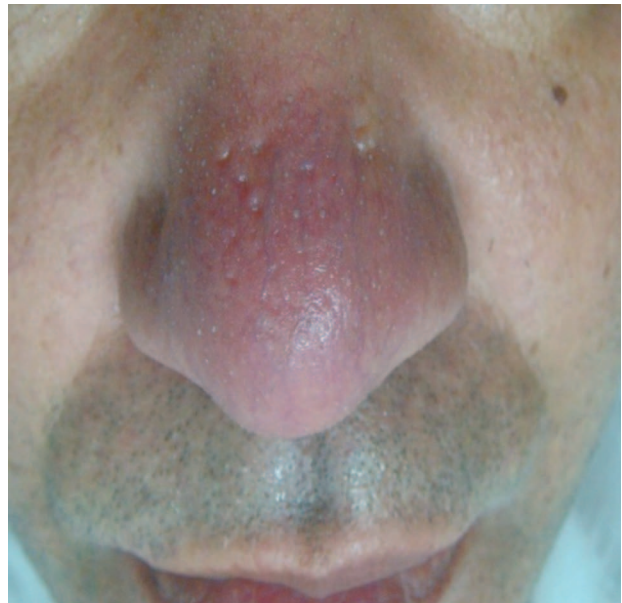
Figure 2. Nose telangiectasia after treatment