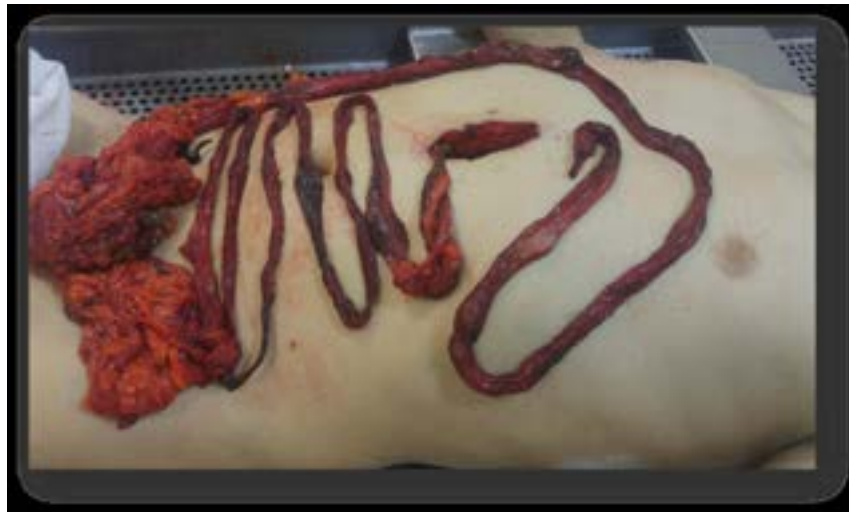
Figure 1. The general appearance of the victim

International Journal of Medical Toxicology & Forensic Medicine