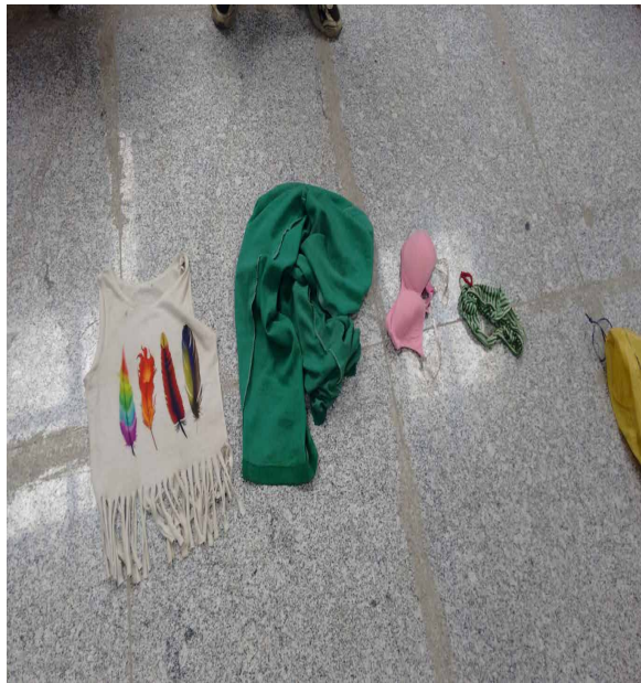
International Journal of Medical Toxicology & Forensic Medicine