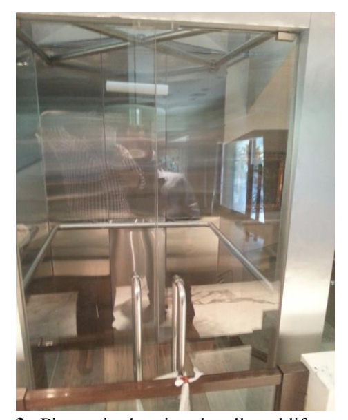
Fig. 3. Picture is showing the alleged lift.