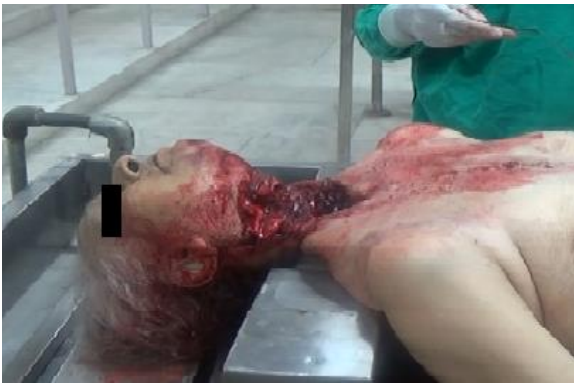
Fig. 2. Picture is showing deep neck wound causing almost decapitation.