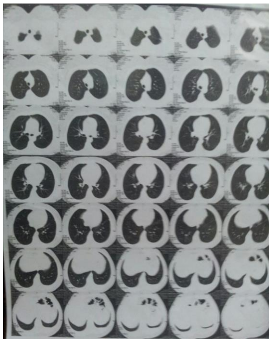
Fig. 3. Picture presents conventional CT scan of case.