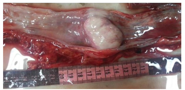
Fig. 2. Oesophageal mass on cutting open.