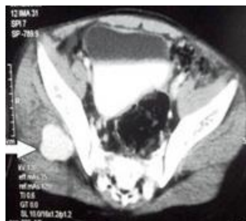
Fig. 3. White arrow points to the pseudo-aneurysm of the inferior artery in coronal section.

visceral injury. Exploration through the gluteal stab wound site was also carried out as there was active ooze from it hemostasis was achieved and the wound was closed in two layers. Post operatively the patient