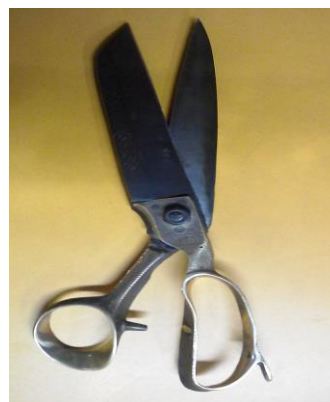
Fig. 1. It shows the tailoring scissor with sharp edges and long prongs.

A brutal murder with hundreds of wounds A 14 year old male presented to our emergency with history of stab to the right gluteal region with a scissor (figure 1) 3 days ago. The boy presented in shock and was resuscitated; there was history of active bleeding from the wound at the time of injury which was managed with packing of the wound. Since the dressing was repeatedly getting soaked, he was referred to our hospital. A CT angiogram was performed which demonstrated a contrast filled structure in direct communication with the inferior gluteal artery 4.2x3.6x3.2 cm (Figure 2, 3). Since the child was hemodynamically unstable and non-availability of endovascular interventional facilities at our center, the patient was taken up for surgery and a transperitoneal approach was used to explore the artery. As the patient's condition was unstable the right internal iliac artery was ligated in to, and search for the individual branches was not made. There was no apparent bowel or other