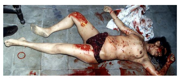
Fig. 1. It shows the Scene of Crime.

Female victims are more frequently killed with multiple stabs by relatives and may not even shows defence wounds (1). In most of the cases of closely related and in the