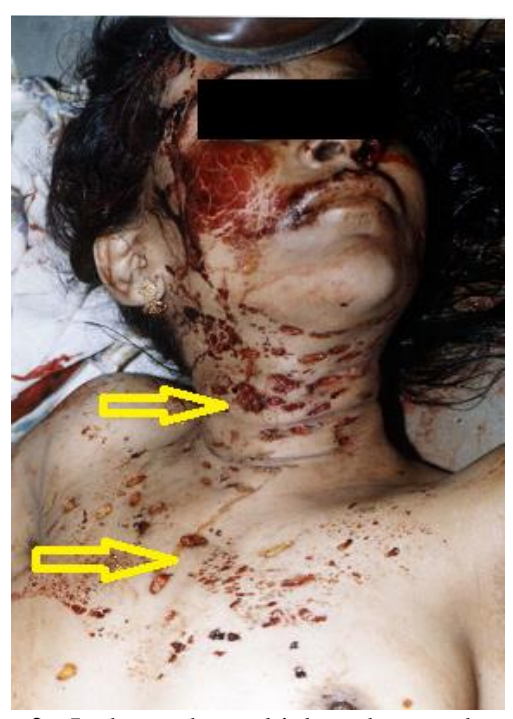
Fig. 2. It shows the multiple stab wounds over chest and neck.