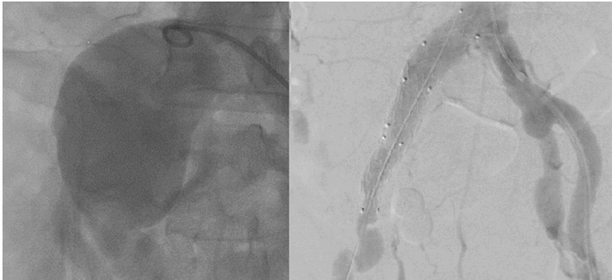
Figure 1. First Angiogram Showing a Large Common Iliac Aneurysm

studies which compared outcomes of open surgery and endovascular repair, Xiang et al. showed that both procedures were safe and effective to repair IIAs with similar postoperative mortality. Compared with open surgery, endovascular treatment can reduce the need for blood transfusion and hospital stay, but it was associated with a higher risk of postoperative ischemic complications [2,7].