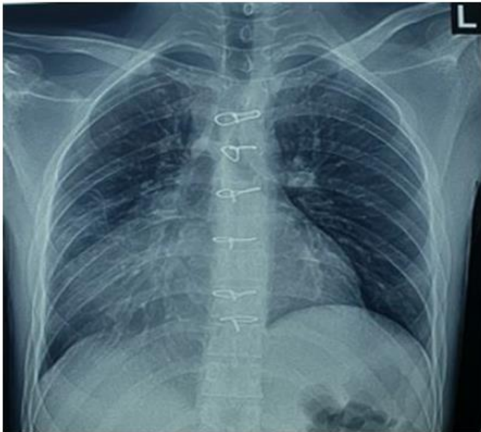
Figure2. The Chest X-Ray also confirmed Coexistence of Donor and Recipient Heart QRS sets in the Patient