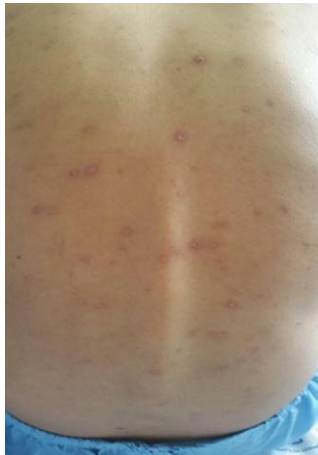
Figure 1. Polymorphic pruritic rash with macular, vesicles and crusty lesions.

of immunoglobulin, which was totally in normal range. The plain chest X-ray showed a consolidation in the middle part of the anterior lobe of the left lung. It was confirmed by the thoracic CT scan findings. Other findings of the thoracic CT scan were diffuse parenchymal infiltration and the ground glass view in the anterior lobe of the left lung (figure 2).