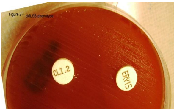
Figure 2. cMLS phenotype

Clindamycin and Erythromycin should be tested and reported 9 .