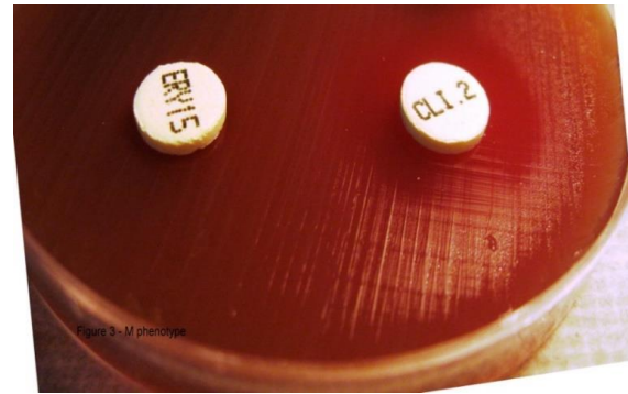
Figure 3. M phenotype

Various studies in other countries report different prevalence of inducible Clindamycin resistance, for