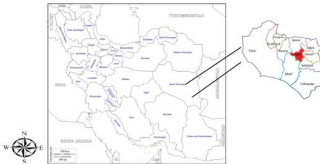
Figure 1. Location of Birjand city in Khorasan-e-jonoobi province

Khorasan-e-jonoobi province with 151,193km 2 covers 9.17% of the total area in Iran. It is located in the East of the country, and its provincial capital is the city of Birjand (coordinates:59°13"N, 32°53"E; 1491 m over sea level) (Figure1). The county had a population of approximately 259,506 out of which 88.63% resided in urban areas and 11.37% in rural vicinities in 2012. The county contains one city, six rural districts, and 380 villages. The climate of Birjand city is of a desert and semi-desert climate type and comprises mountainous areas, foothills, and plains. Due to its location (located near an arid region), it experiences a dry climate, with low humidity and rainfall. In 2014, the average of maximum and minimum mean temperatures in different stations across the province was reported as 24°C and -8°C in July and January, respectively. The average relative humidity is 33% [9].