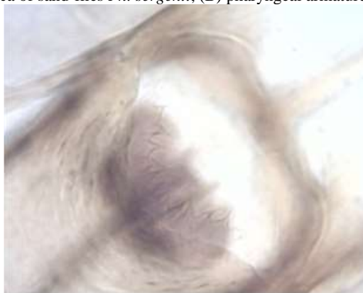
Figure 3. The middle teeth in cibarium, shorter than lateral ones at S. dentate