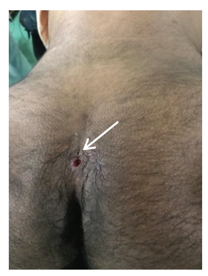
Figure 1. Photograph of the lesion at presentation

A 13-year-old boy presented to the neurosurgical unit in a specialist hospital in north-eastern India with history of a discharging sinus in the sacrococcygeal region (Figure 1). His parents reported that from early infancy the boy had occasional discharge from the area which intermittently became red and painful. These episodes were treated with oral antibiotics by a local physician. He was reported to be doing well both at school and in sports. Parents felt it was necessary to seek specialist advice as his condition was not improving and was affecting his social life and emotional wellbeing.