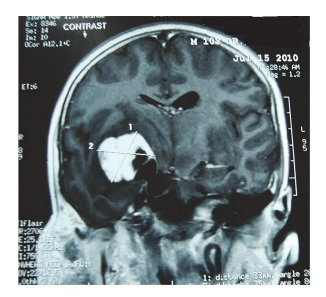
Fig 2. Coronal MRI scans of brain showing right parasellar mass

This case highlights the importance of considering NF1 in a child presenting with painless loss of vision. In developing countries especially in rural or semiurban settings, health infrastructure is aimed more at treatment of pathologies. In the absence of screening and monitoring for conditions such as NF1, different associations with NF1 will often present to the ED in specialist centers like the child described. Cases where delayed diagnosis of NF1 is made, it is important to elicit signs of precocious puberty (predominantly central