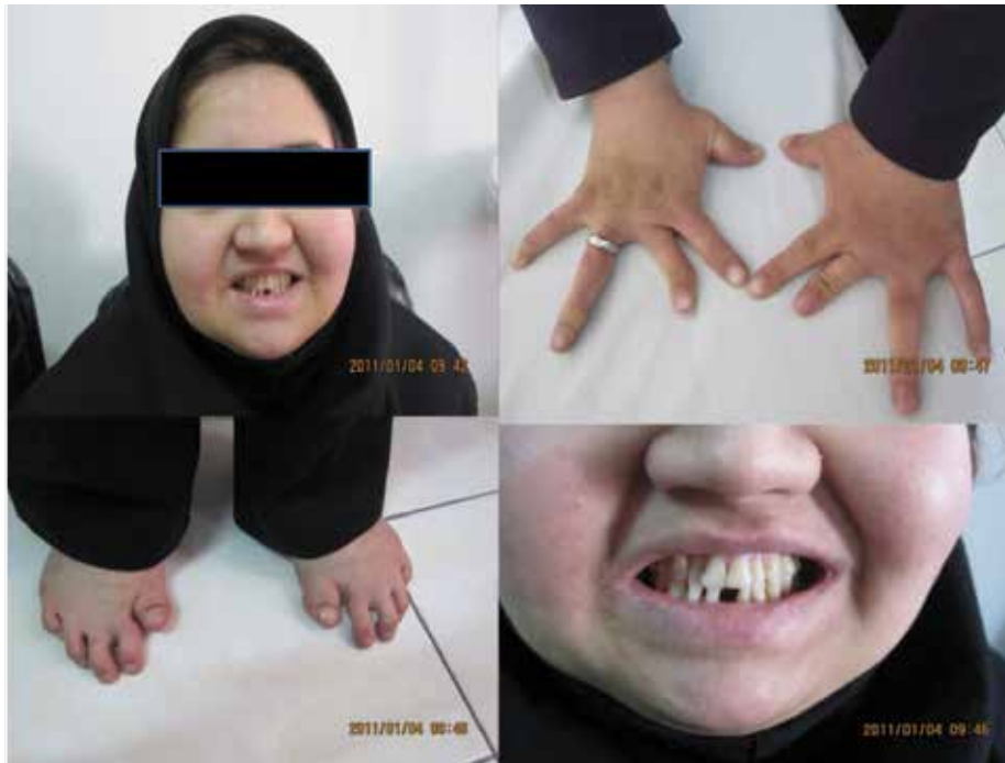
Figs(1-4). Physical characteristic features of the patient

We believed our patient is a variant of oculodentodigital dysplasia with an incomplete feature or a new syndrome with dental and digital malformation, short stature and late onset neurological problems.