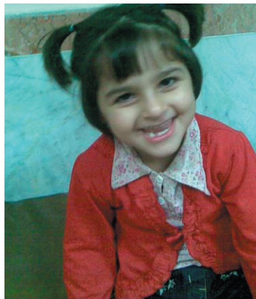
Fig 1. photos of the presented Case of AS.