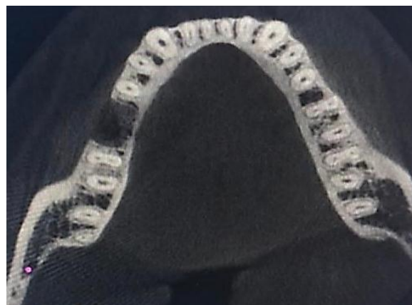
Figure 2. CBCT axial view showing the orifice of canals

Over 1000 CBCT scans were evaluated to find 110 CBCT images of bilateral erupted, semi erupted or impacted mandibular third molars without caries, internal/external root resorption, open apices, previous endodontic treatment or root fracture. Based on a pilot study on 10 patients, sample size was calculated to be 110 CBCT scans. In this cross-sectional study, CBCT images of patients between 22 to 50 years that had been obtained for purposes other than this study (such as extraction or implant placement) were retrieved from the archives of the Oral and Maxillofacial Radiology Department of Islamic Azad University, Tehran. Of 110 patients, 55% were females and 45% were males. The patients had a mean age of 25.02 \pm 2.21 years. Since presence of both mandibular third molars was imperative for this study, the majority of patients who met our inclusion criteria were