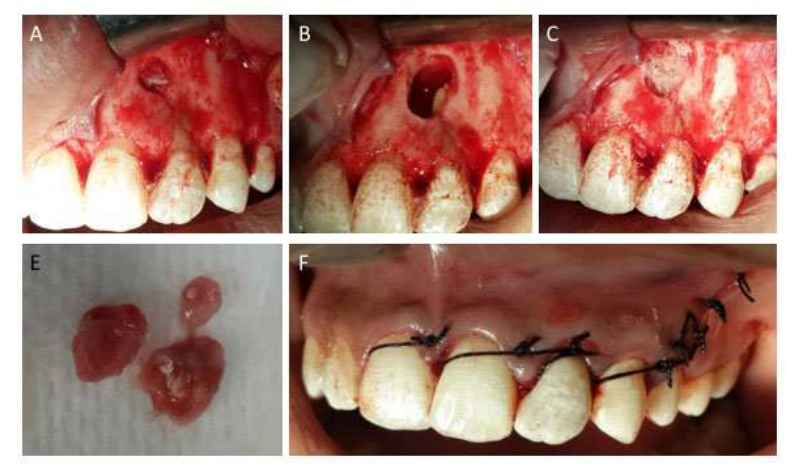
Figure 4. A) View of the surgical field reveals absent cortical plate at apical area, a bony dehiscence is also present on the lateral incisor; B) Granulation tissue completely removed; C) Bony cavity filled with bone graft; D) The removed tissue; E) Sling sutures were used