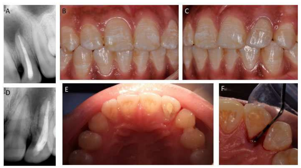
Figure 1. A) Pre-operative Radiograph with a periapical radiolucency and a hint of additional root; B) Frontal view of right maxillary incisor; C) Frontal view of left maxillary incisor; it was longer occlusogingivally and wider mesiodistally than its contralateral; D) Mesial shift view revealed the accessory root and associated radiolucency; E) Palatogingival groove is present below cingulum; F) A periodontontal defect of 5 mm