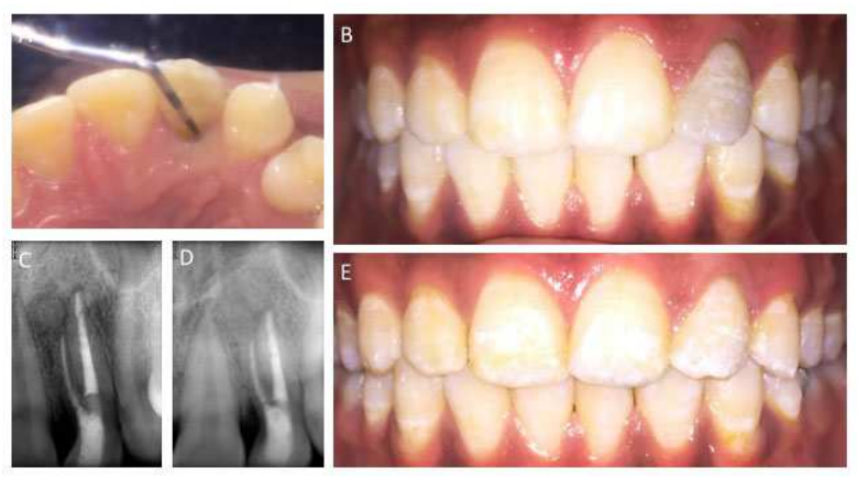
Figure 5. A ) 2 year follow-up, reduced probing depth; B ) Discoloration of the crown was present; C ) 1 year follow-up radiograph; D ) 2 year follow-up radiograph; E ) Walking bleach was used to remove discoloration