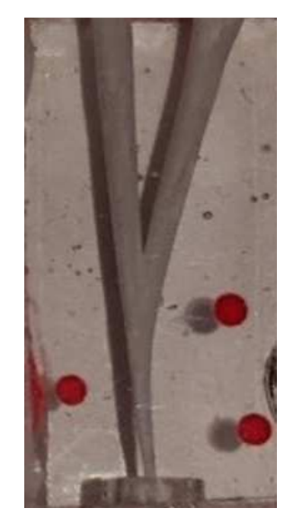
Figure 1. Canal instrumentation in group 2

To decrease these problems and provide the optimum shaped preparation, several instrumentation procedures and instruments have been introduced [6]. Nickel-Titanium (NiTi) rotary instruments have many benefits over hand stainless steel files for example in preserving shape of canal, reducing working time, decreasing operator and patient fatigue and prevalence of technical errors [7].