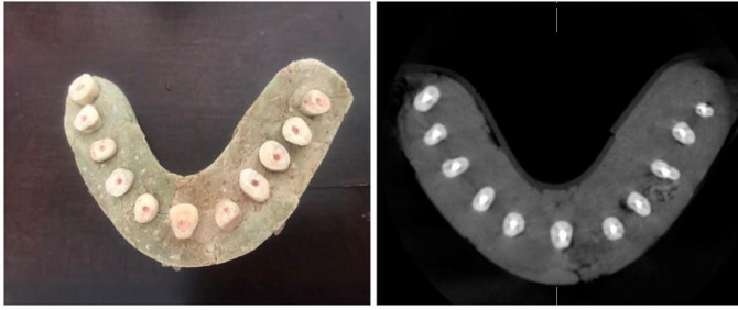
Figure 1. Acrylic cassette with mounted teeth (left) and CBCT image of such costumed cast (right)