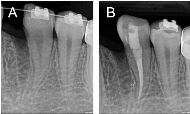
Figure 2. Hemisection and extraction of the mesial portion of the premolar; A) Periapical radiograph before endodontic treatment; B) Periapical radiograph after endodontic treatment

sec with LED curing light (Valo;Ultradent, South Jordan, UT, USA). After removing the rubber dam, the restoration was finished and occlusal adjustment was performed.