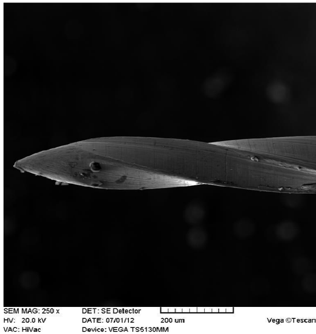
Figure 2. SEM image of a file tip (Larmrose #25)

lowest flute) is less than 1 mm [25]. Our experimental files at the present trial had tip lengths of less than 1 mm; an indication for proper cutting efficiency of all 5 studied brands.