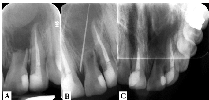
Figure 1: Preoperative radiographs: A) periapical; B) tracing with gutta-percha and C) occlusal view

The differentiation of cysts and granulomas is not possible by traditional radiographic techniques [10]. It is suggested that cyst cavities may have lower densities than granulomas, in computer tomography [11]. Several radiographic features have been proposed, including large lesion size and the presence of a radiopaque rim demarcating the cystic lesion [12].